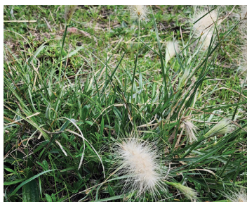
Featherop ( Pennisetum villosum )

The BLMP sets out to deliver a proactive and balanced management plan that benefits both the environment and the community. Head to our website for the latest update on the consultation process for the development of the plan - www.sorell.tas.gov.au/have-your-say/