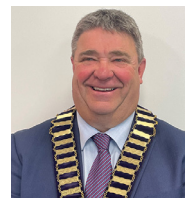
Mayor Kerry Vincent

Contact details for our Councillors can be found on our website at www.sorell.tas.gov.au/contact-us