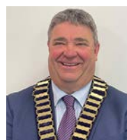
Mayor Kerry Vincent

Contact details for our Councillors can be found on our website at www.sorell.tas.gov.au/contact