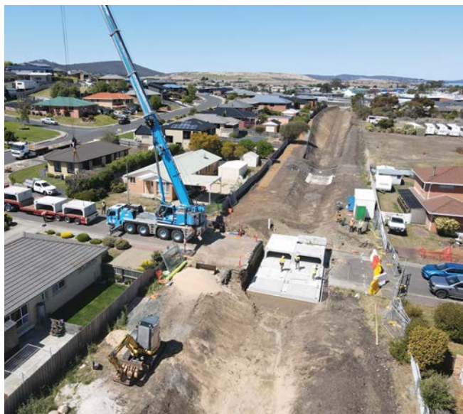
Devenish Drive Stormwater Upgrade Works