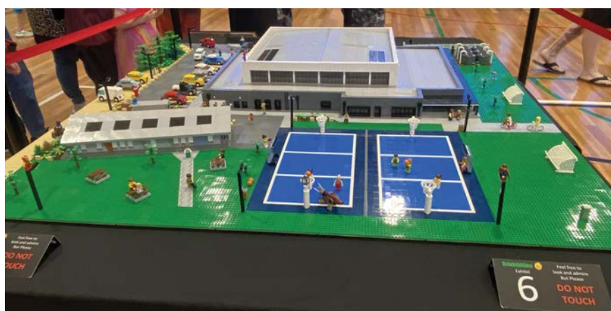
South East Stadium Lego model by Ken Draeger

Nominations close at 5.00pm on Friday 12 January 2024.