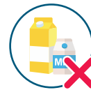
Juice boxes & long-life cartons