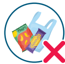
Plastic bags & other soft plastics such as film & wrappers