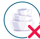
Ceramics (such as dining plates & bowls)

These items are classed as contamination and can reduce the quality of items recovered, interfere with the sort process and harm our workers.