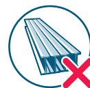
Large sheets of metal