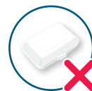
Foam & polystyrene