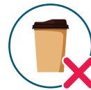
Takeaway cups & coffee cups