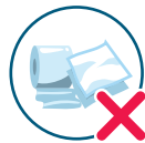
Tissues, napkins & paper towel