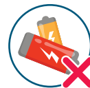
Batteries of any kind