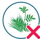
Building & garden waste