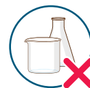
Pyrex (heat resistant glass)