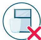
Window & drinking glass