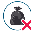
Bagged recycling (recyclables should be placed loose into the recycling bin)