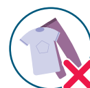
Clothing & shoes