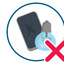
Electronic items (e-waste)